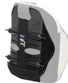
Matrix Back Shell