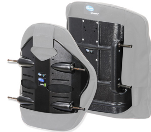
Matrix Back Shell